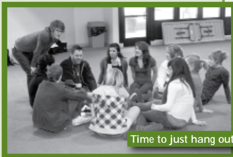
Time to just hang out