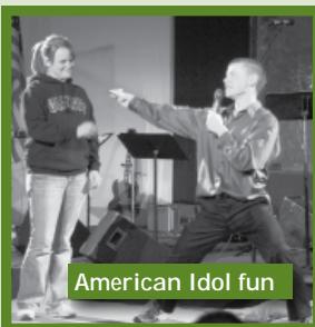
American Idol fun