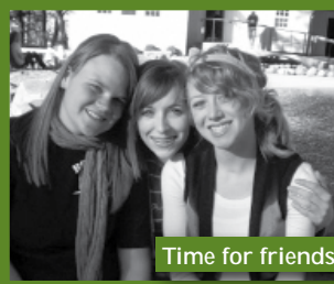
Time for friends