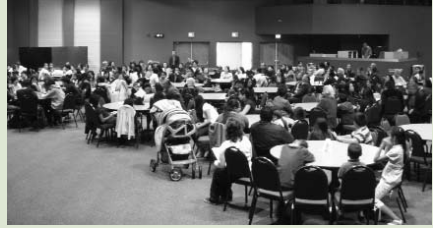
Another great moment: Lao, Chinese and Vietnamese congregations share a meal